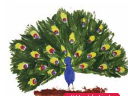
B Magdalin Finola Class IV