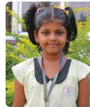
S MUDRA Class I-A PALLAVAS